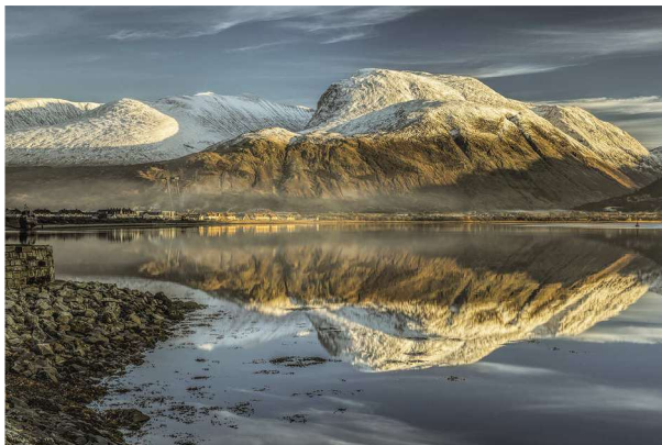
Tallest mountain in the UK Ben Nevis (Scotland)