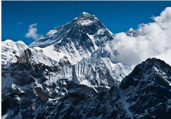
Tallest mountain in the world Mount Everest (in the Himalayas)