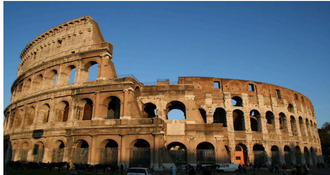
The colosseum in Rome