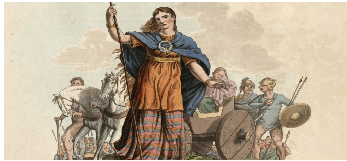
Boudicca was Queen of a Celtic tribe