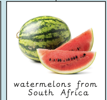
watermelons from South Africa