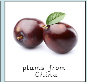
plums from China