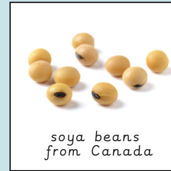
soya beans from Canada