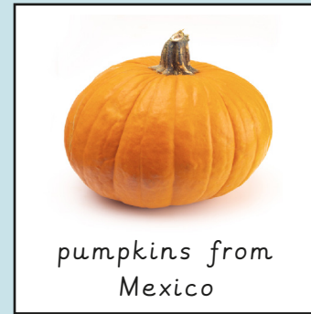
pumpkins from Mexico

Orange and yellow: vitamin A, vitamin C and fibre.