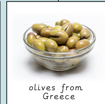
olives from Greece