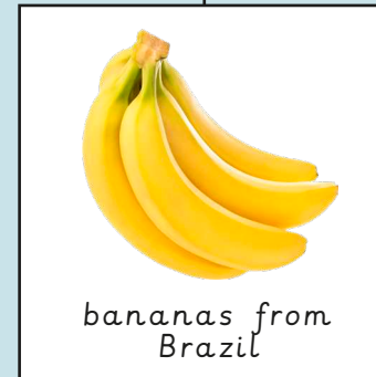
bananas from Brazil